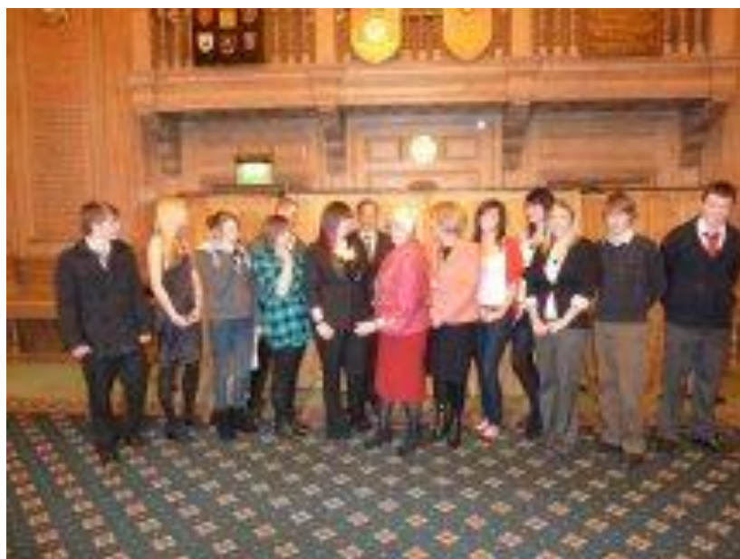
Leeds Rotary Club Service Above Self Service Awards