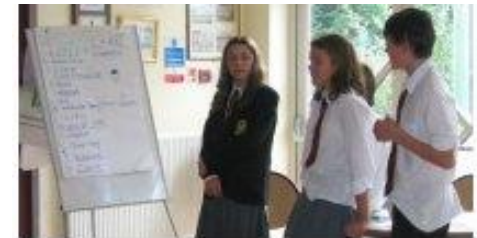
Deciding on which charities to support at an initial interest meeting

District Contact Youth Service Resources Team